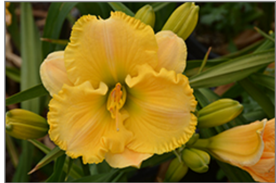
Collier Daylily flowers

Collier Daylily will grow to be about 24 inches tall at maturity, with a spread of 24 inches. When grown in masses or used as a bedding plant, individual plants should be spaced approximately 18 inches apart. It grows at a medium rate, and under ideal conditions can be expected to live for approximately 10 years. As an herbaceous perennial, this plant will usually die back to the crown each winter, and will regrow from the base each spring. Be careful not to disturb the crown in late winter when it may not be readily seen!