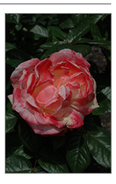
Mercury Rising Rose flowers