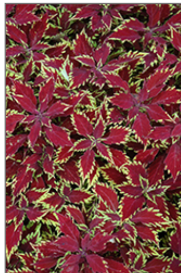
ColorBlaze Royale Apple Brandy Coleus foliage