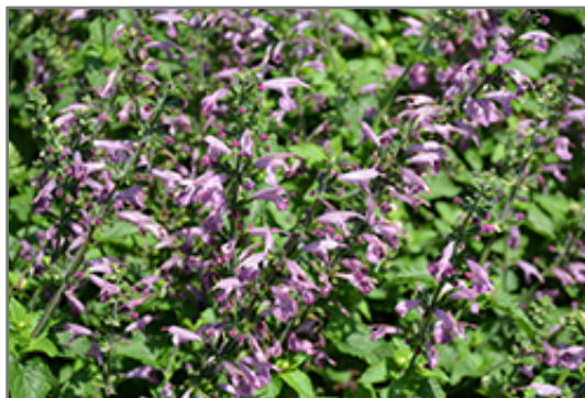
Summer Jewel Lavender Sage flowers