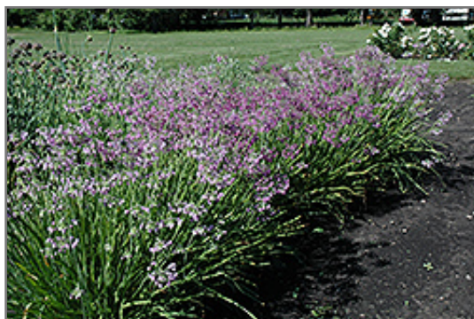
Nodding Onion in bloom