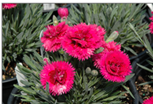
Starlette Pinks flowers