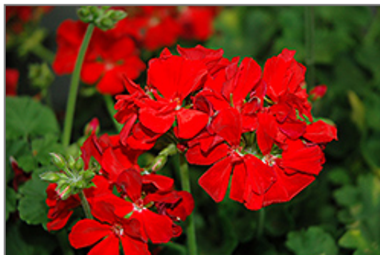
Dixieland Orange Geranium flowers