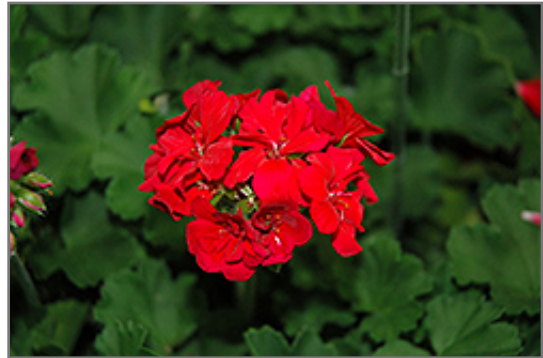
Dixieland Dark Pink Geranium flowers