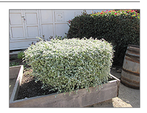
Licorice Plant