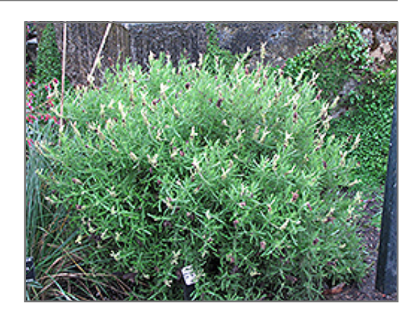
Lemon Leigh Lavender in bloom

This is a relatively low maintenance plant, and can be pruned at anytime. It is a good choice for attracting bees and butterflies to your yard, but is not particularly attractive to deer who tend to leave it alone in favor of tastier treats. It has no significant negative characteristics.