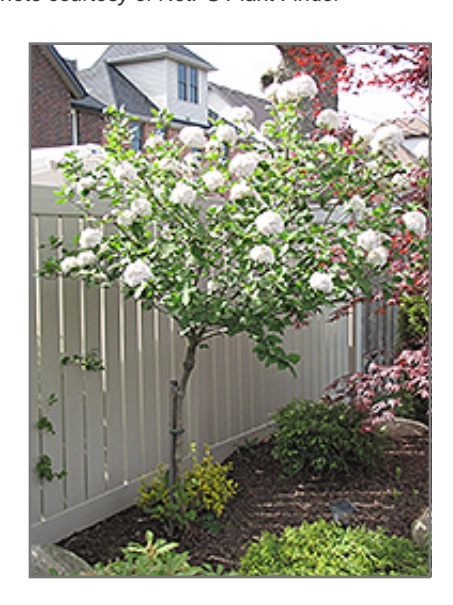
Cayuga Fragrant Viburnum (tree form) in bloom

Cayuga Fragrant Viburnum (tree form) is recommended for the following landscape applications;