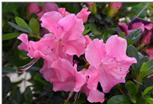
Pink Adoration Azalea flowers

Pink Adoration Azalea will grow to be about 24 inches tall at maturity, with a spread of 3 feet. It tends to be a little leggy, with a typical clearance of 1 foot from the ground. It grows at a slow rate, and under ideal conditions can be expected to live for 40 years or more.