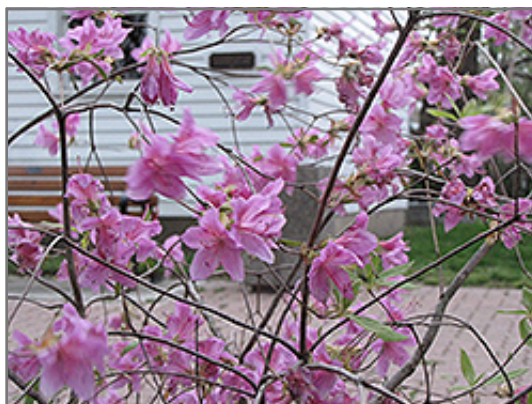
Lake Ontario Azalea flowers

Lake Ontario Azalea will grow to be about 6 feet tall at maturity, with a spread of 5 feet. It tends to be a little leggy, with a typical clearance of 1 foot from the ground, and is suitable for planting under power lines. It grows at a slow rate, and under ideal conditions can be expected to live for 40 years or more.