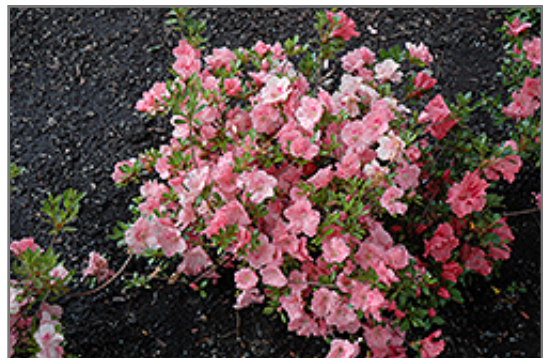
Hilda Niblett Azalea in bloom