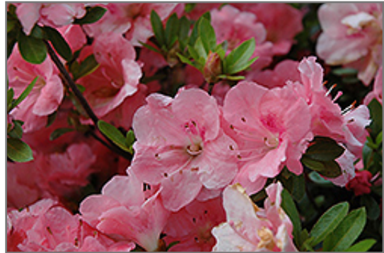
Hilda Niblett Azalea flowers