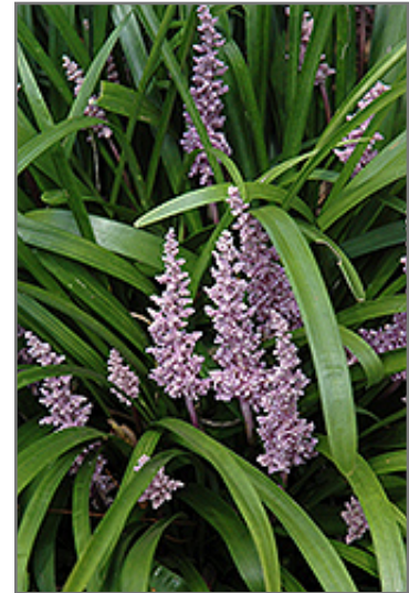
Lily Turf flowers