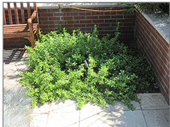
Creeping Mirror Bush