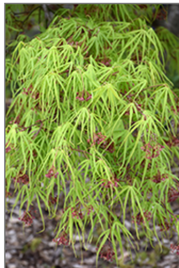
Shinobuga Oka Japanese Maple foliage

Shinobuga Oka Japanese Maple is recommended for the following landscape applications;