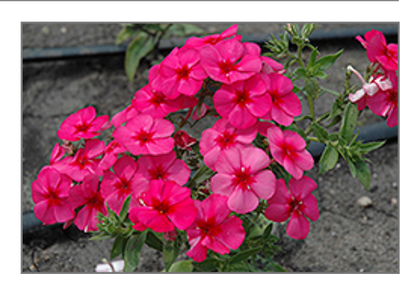
Summer Majesty Phlox flowers