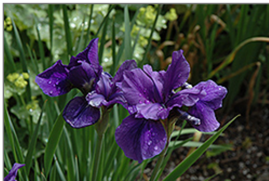
Pirate Prince Siberian Iris flowers

Pirate Prince Siberian Iris will grow to be about 28 inches tall at maturity, with a spread of 24 inches. When grown in masses or used as a bedding plant, individual plants should be spaced approximately 18 inches apart. It grows at a medium rate, and under ideal conditions can be expected to live for approximately 10 years. As an herbaceous perennial, this plant will usually die back to the crown each winter, and will regrow from the base each spring. Be careful not to disturb the crown in late winter when it may not be readily seen!