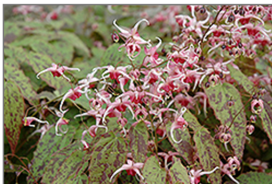
Pink Champagne Fairy Wings flowers