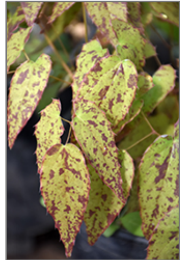
Pink Champagne Fairy Wings foliage

Pink Champagne Fairy Wings will grow to be about 12 inches tall at maturity extending to 16 inches tall with the flowers, with a spread of 24 inches. When grown in masses or used as a bedding plant, individual plants should be spaced approximately 18 inches apart. Its foliage tends to remain dense right to the ground, not requiring facer plants in front. It grows at a medium rate, and under ideal conditions can be expected to live for approximately 10 years. As an herbaceous perennial, this plant will usually die back to the crown each winter, and will regrow from the base each spring. Be careful not to disturb the crown in late winter when it may not be readily seen!