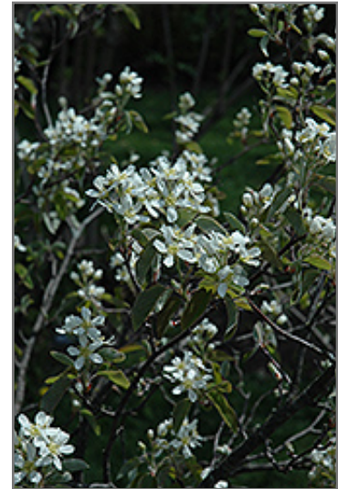
Parkhill Saskatoon flowers

Aside from its primary use as an edible, Parkhill Saskatoon is suitable for the following landscape applications;