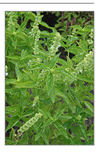
Sweet Italian Basil flowers

This plant is quite ornamental as well as edible, and is as much at home in a landscape or flower garden as it is in a designated herb garden. It should only be grown in full sunlight. It prefers to grow in average to moist conditions, and shouldn't be allowed to dry out. It is not particular as to soil type or pH. It is somewhat tolerant of urban pollution. This is a selected variety of a species not originally from North America. It can be propagated by cuttings; however, as a cultivated variety, be aware that it may be subject to certain restrictions or prohibitions on propagation.