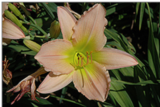
Kwan Yin Daylily flowers