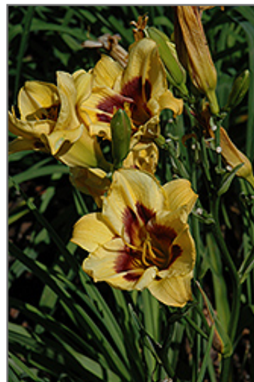
Black Pepper Daylily flowers

Black Pepper Daylily will grow to be about 18 inches tall at maturity extending to 24 inches tall with the flowers, with a spread of 18 inches. When grown in masses or used as a bedding plant, individual plants should be spaced approximately 14 inches apart. It grows at a medium rate, and under ideal conditions can be expected to live for approximately 10 years. As an evergreen perennial, this plant will typically keep its form and foliage year-round.