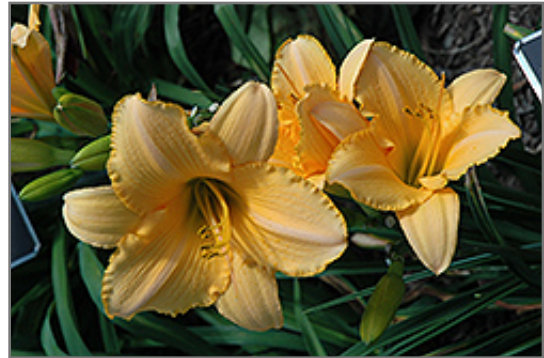
Ballet Belle Daylily flowers