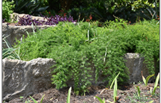
Sprengeri Asparagus Fern

Sprengeri Asparagus Fern is recommended for the following landscape applications;