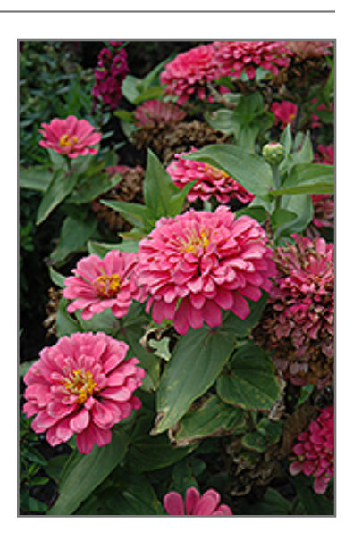
Champagne Toast Zinnia flowers

Champagne Toast Zinnia will grow to be about 16 inches tall at maturity, with a spread of 12 inches. When grown in masses or used as a bedding plant, individual plants should be spaced approximately 8 inches apart. Its foliage tends to remain dense right to the ground, not requiring facer plants in front. This fast-growing annual will normally live for one full growing season, needing replacement the following year.