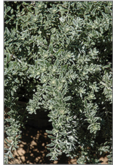
Smokey Coast Rosemary foliage