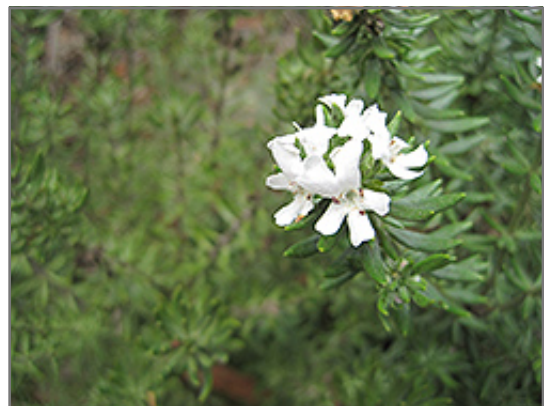
Smokey Coast Rosemary flowers