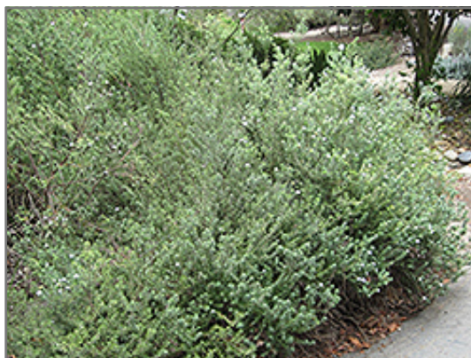
Smokey Coast Rosemary

This shrub does best in full sun to partial shade. It is very adaptable to both dry and moist locations, and should do just fine under average home landscape conditions. It is considered to be drought-tolerant, and thus makes an ideal choice for xeriscaping or the moisture-conserving landscape. It is not particular as to soil type or pH, and is able to handle environmental salt. It is somewhat tolerant of urban pollution. Consider applying a thick mulch around the root zone in winter to protect it in exposed locations or colder microclimates. This is a selected variety of a species not originally from North America.