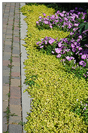
Golden Creeping Jenny