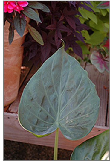
Hooded Dwarf Elephant's Ear foliage

Hooded Dwarf Elephant's Ear will grow to be about 3 feet tall at maturity, with a spread of 3 feet. Although it's not a true annual, this plant can be expected to behave as an annual in our climate if left outdoors over the winter, usually needing replacement the following year. As such, gardeners should take into consideration that it will perform differently than it would in its native habitat.