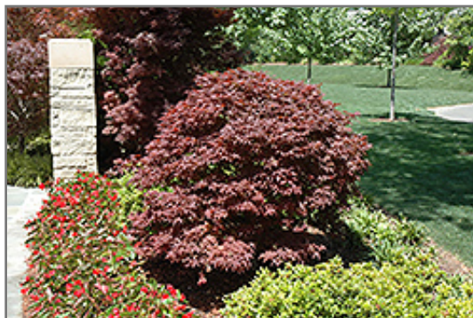
Rhode Island Red Japanese Maple