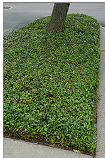
Asian Jasmine