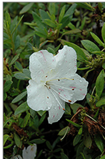
Encore Autumn Starlite Azalea flowers