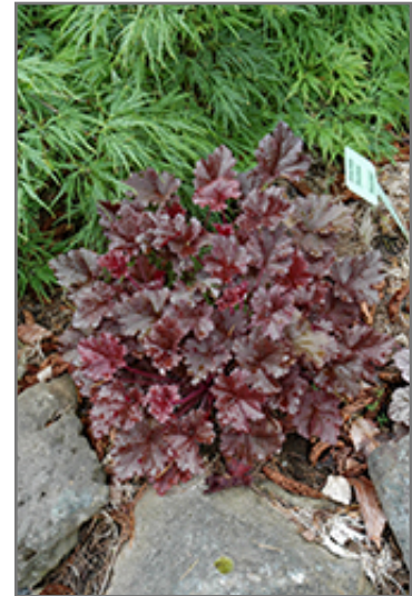
Dark Secret Coral Bells

Dark Secret Coral Bells is recommended for the following landscape applications;