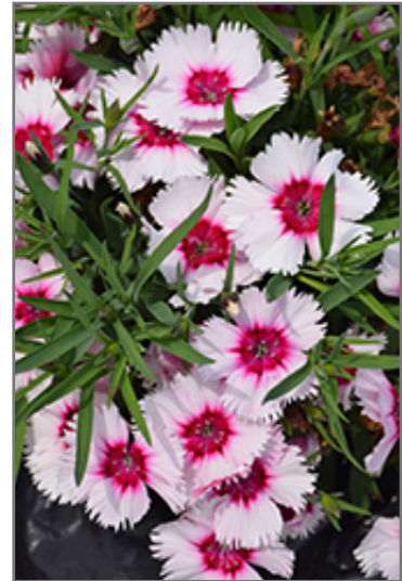
Super Parfait Raspberry Pinks flowers

Super Parfait Raspberry Pinks is a fine choice for the garden, but it is also a good selection for planting in outdoor pots and containers. It is often used as a 'filler' in the 'spiller-thriller-filler' container combination, providing a mass of flowers and foliage against which the thriller plants stand out. Note that when growing plants in outdoor containers and baskets, they may require more frequent waterings than they would in the yard or garden. Be aware that in our climate, most plants cannot be expected to survive the winter if left in containers outdoors, and this plant is no exception. Contact our experts for more information on how to protect it over the winter months.