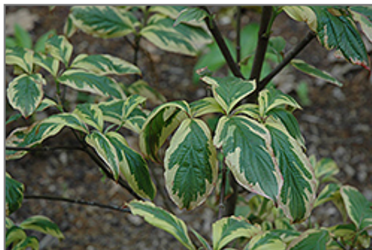
Firebird Flowering Dogwood foliage

Firebird Flowering Dogwood is recommended for the following landscape applications;