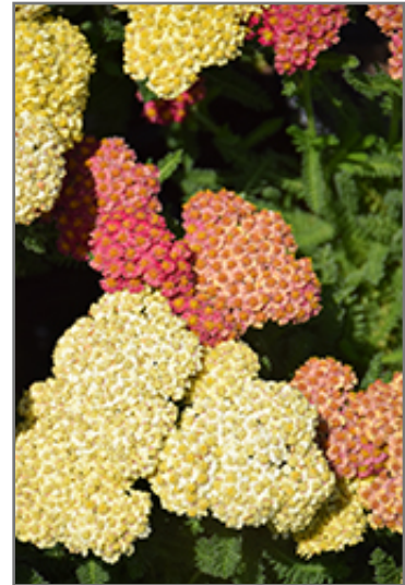
Desert Eve Terracotta Yarrow flowers

Desert Eve Terracotta Yarrow is recommended for the following landscape applications;