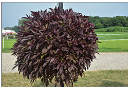
Illusion Garnet Lace Sweet Potato Vine