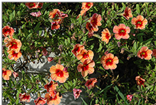
Isabells Coral Reef Calibrachoa flowers