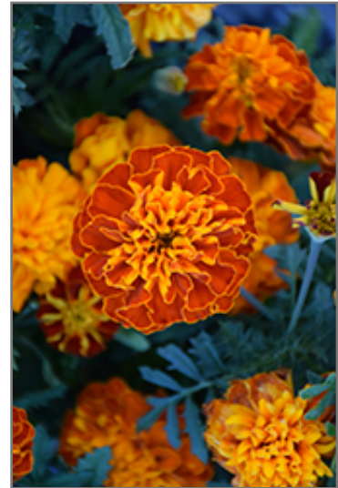
Bonanza Harmony Marigold flowers