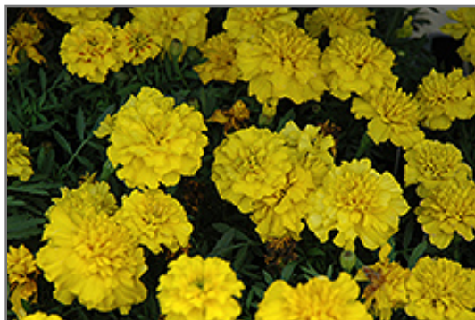
Boy Yellow Marigold flowers