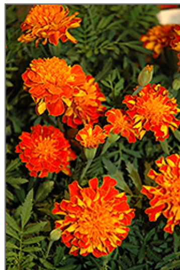
Cresta Flame Marigold flowers