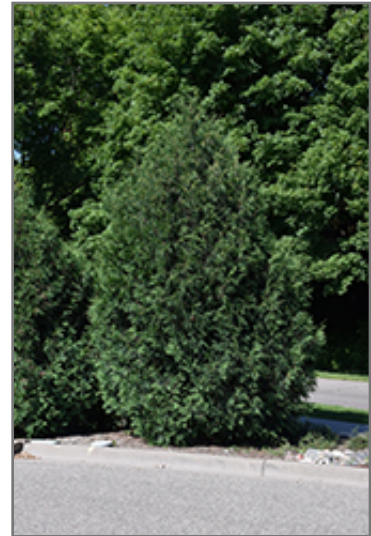
Techny Arborvitae