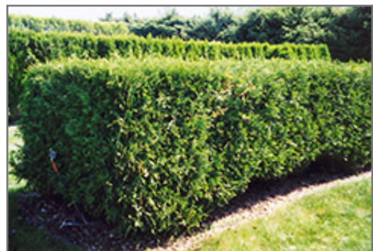
Techny Arborvitae