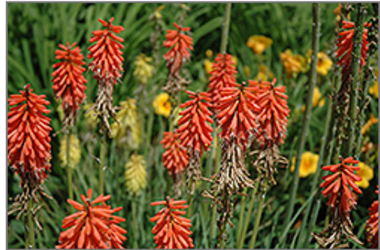
Bressingham Comet Torchlily flowers