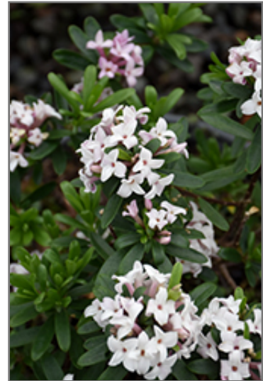
Eternal Fragrance Daphne flowers

Eternal Fragrance Daphne will grow to be about 3 feet tall at maturity, with a spread of 3 feet. It tends to fill out right to the ground and therefore doesn't necessarily require facer plants in front. It grows at a slow rate, and under ideal conditions can be expected to live for approximately 20 years.