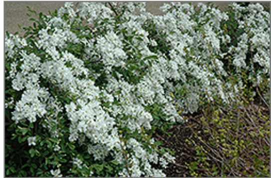
The Bride Pearlbrush in bloom

This plant is not reliably hardy in our region, and certain restrictions may apply; contact the store for more information.