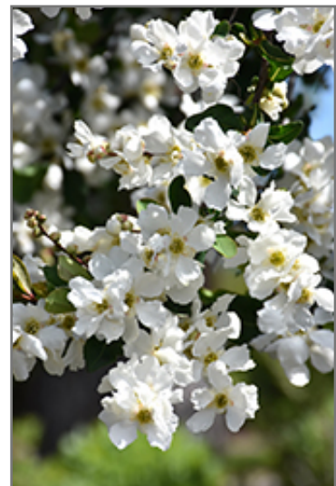
The Bride Pearlbush flowers