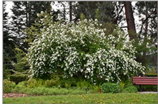
The Bride Pearlbush in bloom