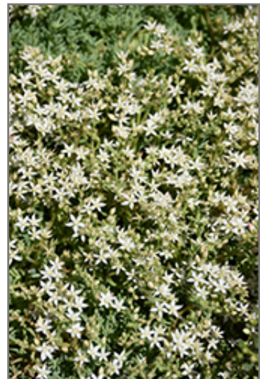
Dwarf Spanish Stonecrop flowers