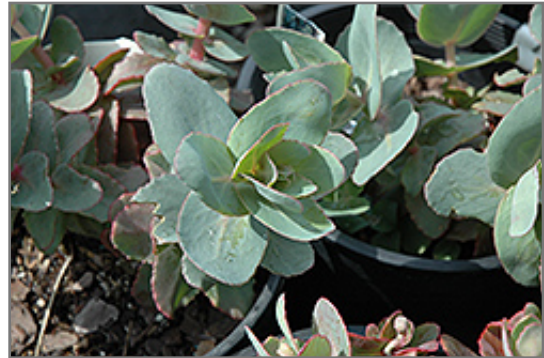
Hab Gray Stonecrop foliage

Hab Gray Stonecrop is recommended for the following landscape applications;