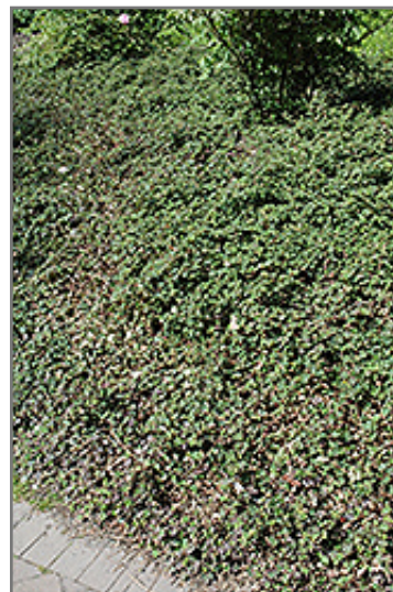
Formosan Carpet Creeping Taiwan Bramble