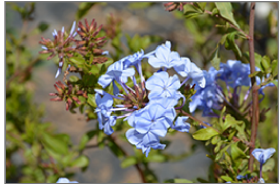
Imperial Blue Plumbago flowers